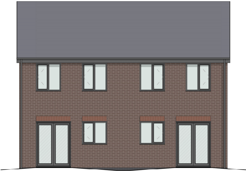
Rear Elevation 1 : 100