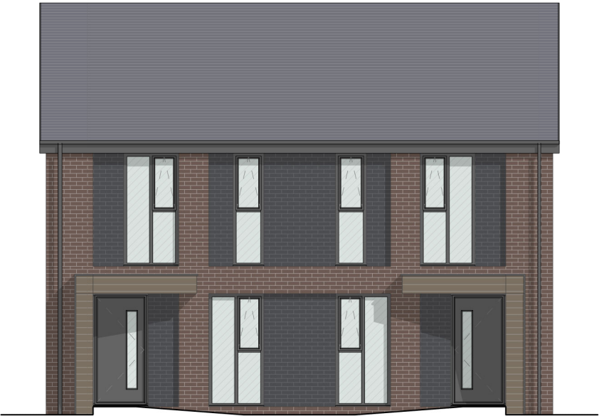
Front Elevation 1 : 100